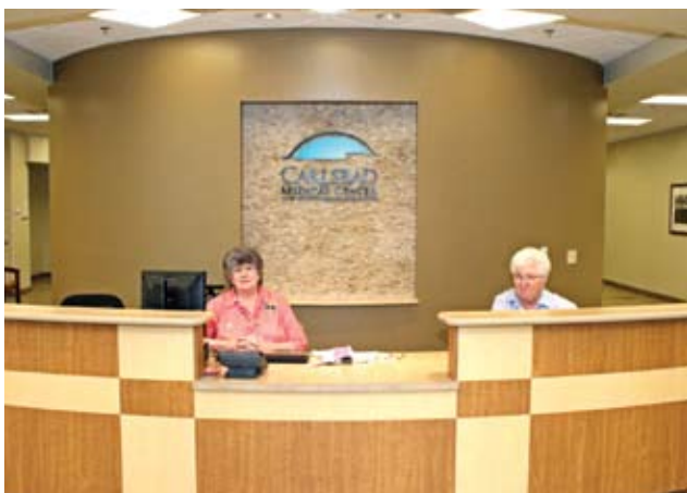
Visitors to CMC are greeted by Auxiliary volunteers at the new information desk.